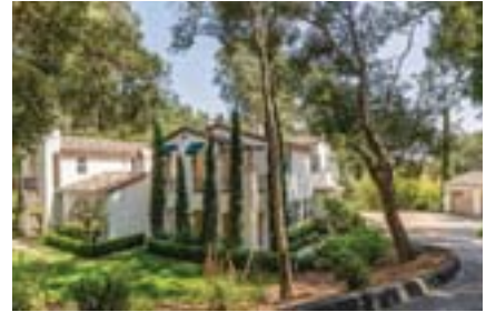
18 Charles Hill Circle, Orinda

Santa Barbara Style Built in 2003, Close-In + Private Magical Central Courtyard