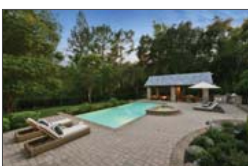
5 Bedroom + Office + Bonus | 5.5 Bath | 6011± Sq. Ft. | .97± Acre Lot Offered at $4,495,000 | 4015HappyValleyRoad.com